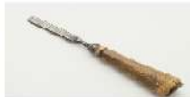
Slag Removal Scrapper