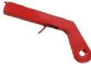
Flint Igniter (1 Good for 50 shots)