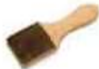
File Card Brush to Clean the Objects to be welded