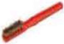
Weld Cavity Cleaning Brush