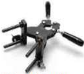
Mould Handle (1 for Every Three moulds)