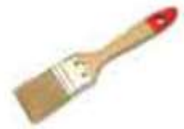
Mould cleaning Brush